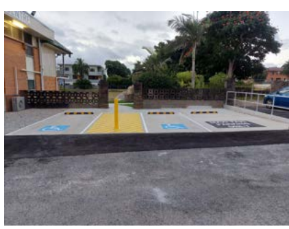
Disabled and Maxi Taxi Parking