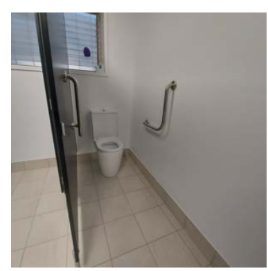
Accessible cubicle in the Men's toilets