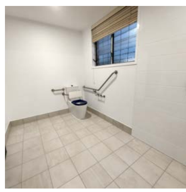
Disabled toilet downstairs