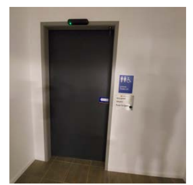
Easy access sliding door to disabled toilet