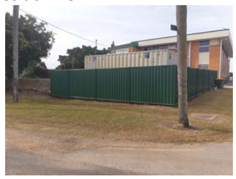
New Colorbond fence